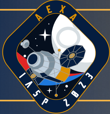
TABLE OF CONTENTS SPONSORS 2023 - EDUPROGRAMS